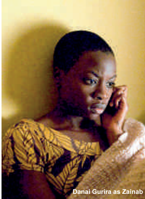
Danai Gurira as Zainab

'A perfectly balanced movie delivering its serious message while remaining lively, charming and thought-provoking.' JIM HALL, 4 FILM